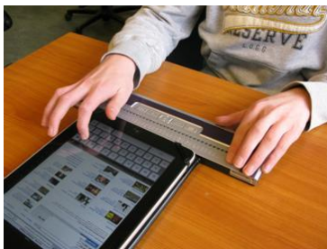
iPad with Refreshable Braille Display

A refreshable braille display can be used as a peripheral device with a desktop, laptop or mobile computing device, providing braille translation of documents, websites, and other text information.