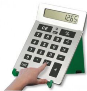
Big Key Calculator

http://blennzonlinelearninglibrary.edublogs.org/2012/12/01/developing-early-abacus-skills-at-primary-school/