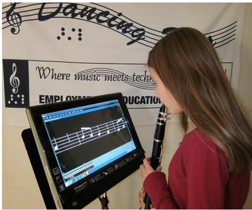
LimeLighter Music Reader