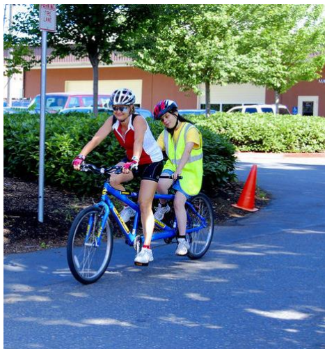
Tandem cycling