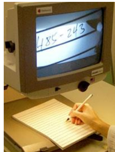
Writing with CCTV