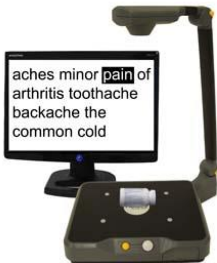
Video Magnification System