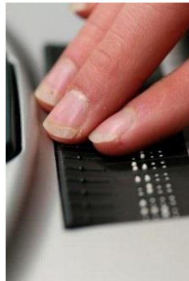
Refreshable Braille Display