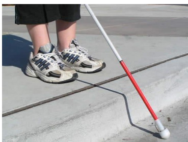
Student with cane

GPS devices use satellite technology to provide auditory feedback to individuals regarding their position, direction of movement, environment, and routes. They may be dedicated devices, or GPS technology may be integrated into other devices such as a smart phone, mobile device, or braille notetaker.