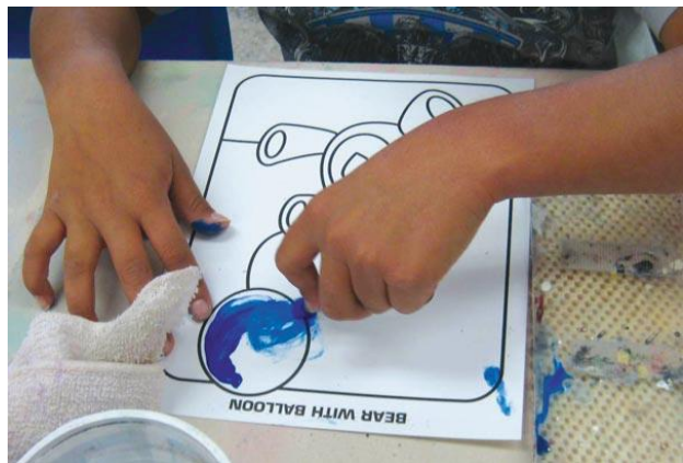
Embossed coloring page Retrieved from: https://shop.aph.org/wcsstore/APHConsumerDirect/Attachment/products_secondary/1-03933-00-Paint-Pot-Palette_Bear.jpg