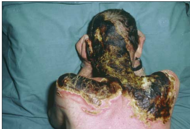
With the increased survival of patients with large burns, there is increased focus on the psychological challenges and recovery that such patients must face

Depression and anxiety —Symptoms of depression and anxiety are common and start to appear in the acute phase of recovery. Acute stress disorder (occurs in the first month) and post-traumatic stress disorder (occurs after one month) are more common after burns than other forms of injury. Patients with these disorders typically have larger burns and more severe pain and express more guilt about the precipitating event. The severity of depression is correlated with a patient's level of resting pain and level of social support.