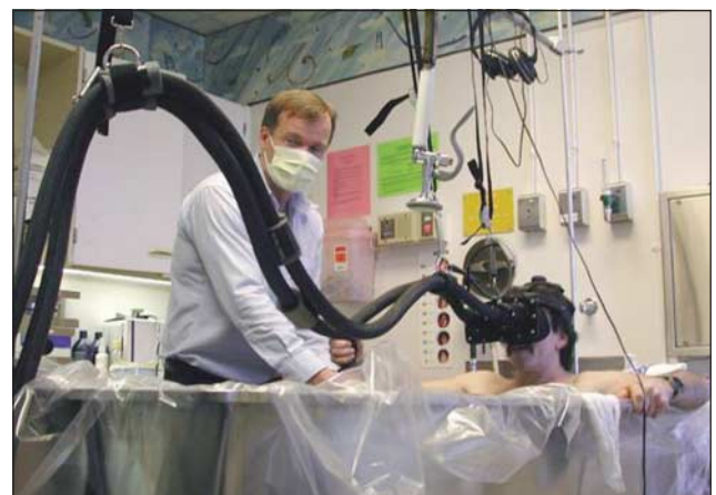
A patient's attention is taken up with "SnowWorld" via a water-friendly virtual reality helmet during wound care in the hydrotub